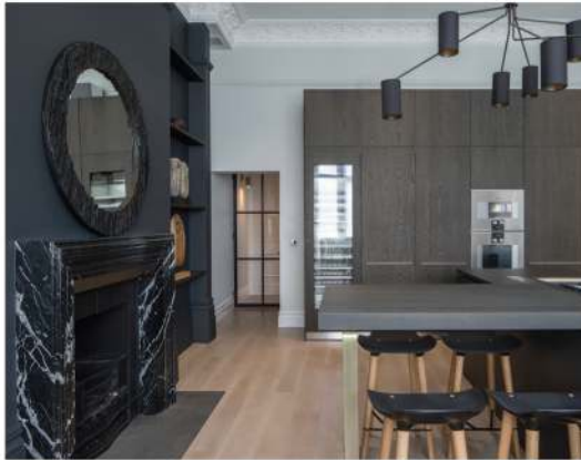
This Belsize Park dining area was designed by Roselind Wilson Design and completed in May 2016.

The kitchen of this impressive stucco fronted property in Belsize Park would have formed the reception room when originally built. As a result, it benefits from impressively high ceilings of 3.8m and beautifully ornate cornicing and a ceiling rose, together with a fireplace as the central feature. The client wished to adapt this stately room into a large kitchen and dining area to suit their lifestyle yet still allow this space to feel like a room and not specifically like a kitchen. In addition they wanted to incorporate their love of modern materials like metal, timber and marble into the space whilst ensuring that it functions efficiently. The natural progress for Roselind Wilson Design was to allow for a banquette seating area in the beautiful bay window. This would maximise the seating space and allow for a stunning oval marble table set against a strong black and white striped fabric for the bespoke bench.