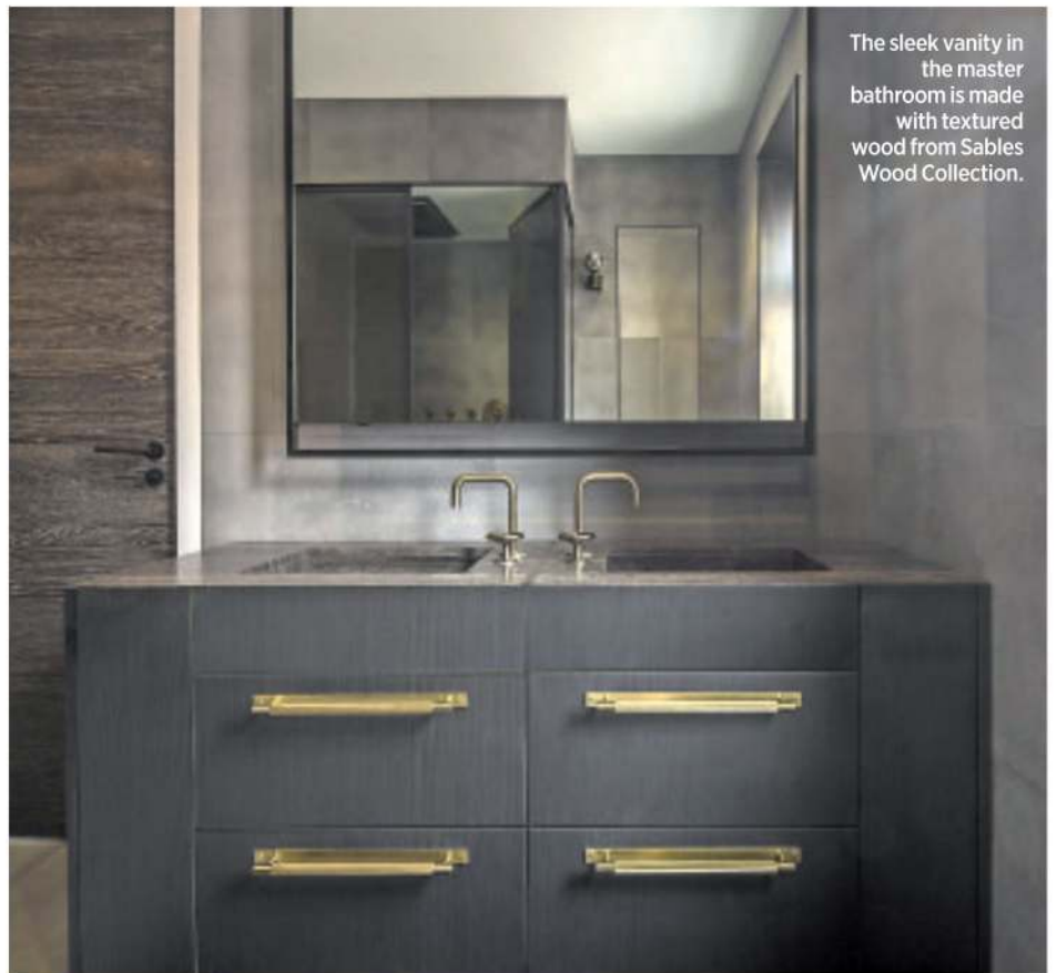
The sleek vanity in the master bathroom is made with textured wood from Sables Wood Collection.