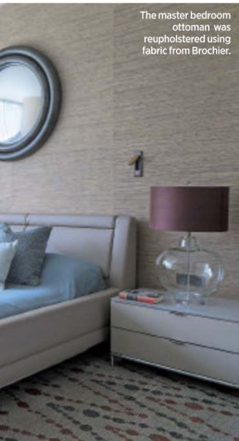
The master bedroom ottoman was reupholstered using fabric from Brochier.