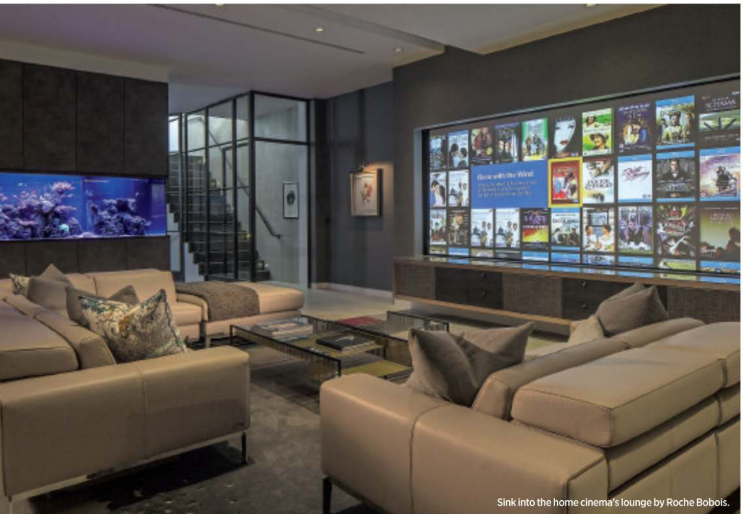
Sink into the home cinema's lounge by Roche Bobois.