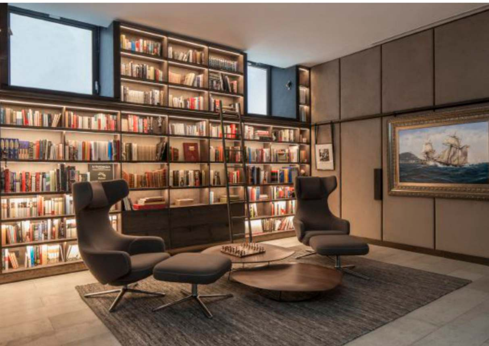
ABOVE: Armchairs by Vitra complete the library's look.

WHEN THE RENTERS OF a Belsize Park property became homeowners of an Antrim Grove address, they called on the creative minds behind a Queen's Park interior design studio to transform the house into their ideal home that captured their Spanish origins.