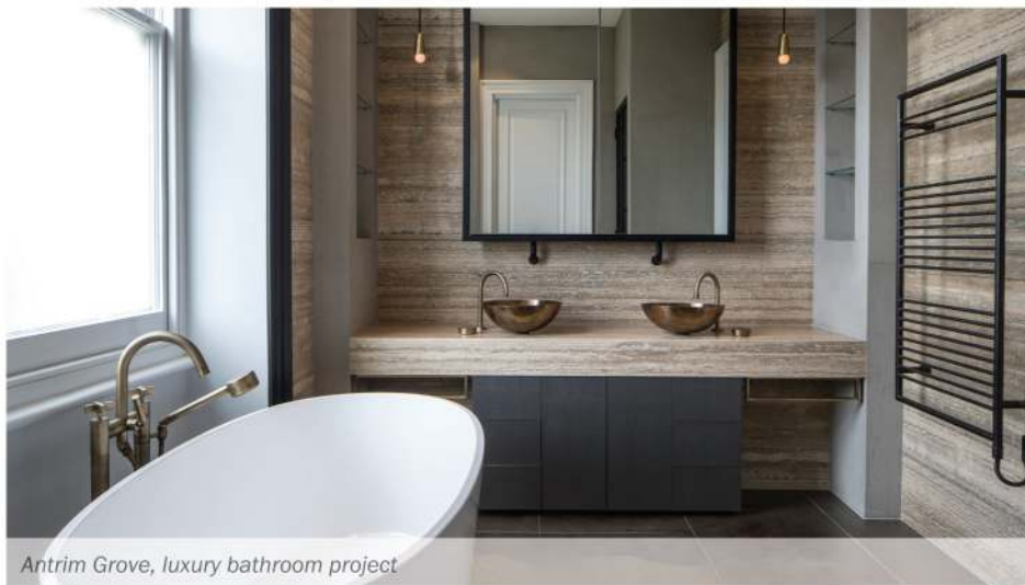
Antrim Grove, luxury bathroom project